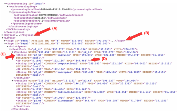
Figure 3: Result of the processing by pdftalto: (A) style block (information about fonts); (B) page block; (C) character string; (D) spacing information

operations alongside batch normalization after every layer to combat gradient vanishing and internal covariance shift in the network. However, in YOLOv4 the authors have identified and grouped a range of different techniques that significantly increase the performance of the network into categories described as either bag of freebies (Cutmix, DropBlock, Mosaic Data Augmentation, label smoothing): applying these techniques increase the mAP of the model without compromising on the inference time; or bag of specials (Mish activation, Cross Stage Partial Connections, multi weighted input residual connections): these techniques increase the accuracy of detection with a small increase in the inference time.